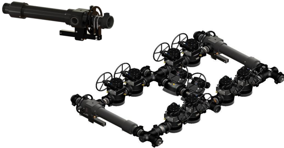
3" Fig 1502 Debris Catcher

End fitting support comes standard on all debris catcher manifolds to make for easier and safer screen changes. Flow through design allows for rig-in to blow down tank for easy cleanout if facilities exist. Designed to have minimal pressure drop across screen up to 85% screen capacity. All internal components have Nitride treatment for protection against erosion and corrosion. Slide mechanism is black powder coated for a durable finish, even after repeated use.