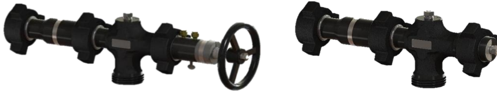
2" Fig 1502 Chokes

All chokes are manufactured to the same specifications and follows the same Quality Management System as all other BRC products.