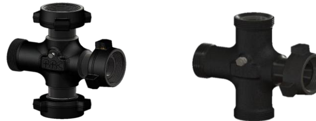
3" Fig 1502 Crosses