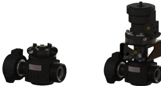
2" Fig 1502 Plug Valves

All plug valves are fully assembled, tested in our facility, and are provided with documentation including, pressure test charts, assembly logs & Certificates of Compliance.