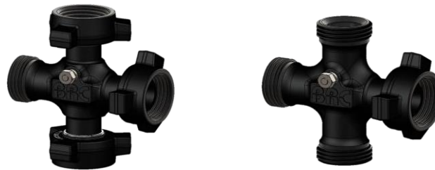
2" Fig 1502 Crosses

All fittings come standard with the Nitride treatment for industry leading service life in all high pressure oil & gas applications, including fracturing, flow back, cementing & any other high pressure abrasive slurry application. All fittings are manufactured under the BRC Advanced Technologies Inc. quality management system, ensuring that the customer receives the highest quality product every time.